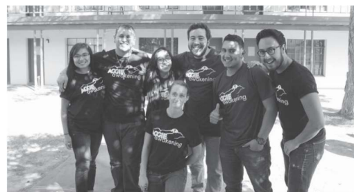
Top: All students who participated in Aggie Awakening IX. Bottom: One of the small groups.